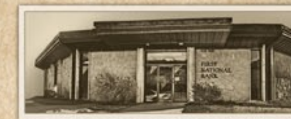
The unusual chandelier at the bank was made in West Germany and is composed of approximately 300 separate small, hand-blown glass globes designed to fit in a perfect circle and lighted from behind with 65 clear electric bulbs.

1972 Current main bank building completed, 806 W. 5th Street